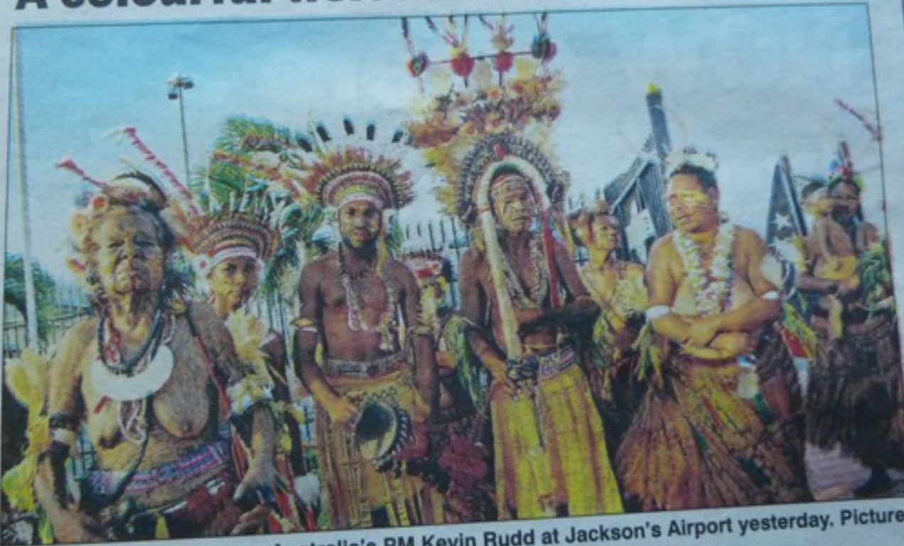
MEKEO dancers welcome Australia's PM Kevin Rudd at Jackson's Airport yesterday.