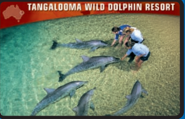
TANGALOOMA WILD DOLPHIN RESORT