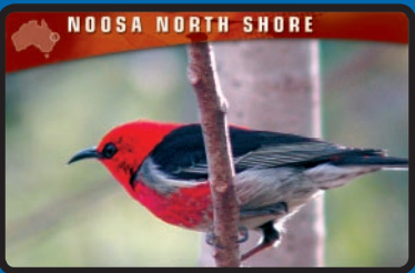
NOOSA NORTH SHORE