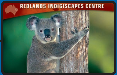
REDLANDS INDIGISCAPES CENTRE