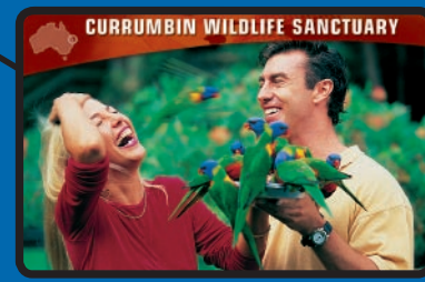
CURRUMBIN WILDLIFE SANCTUARY